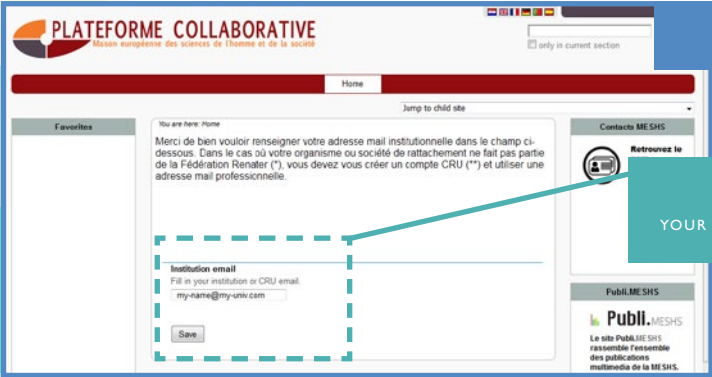
INSTITUTIONAL EMAIL VERIFICATION